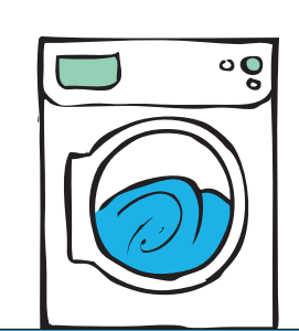
15. Always wash overalls separately

10. Use tissues rather than a handkerchief