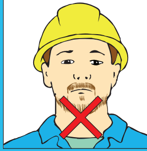
5. Beards can prevent masks sealing properly