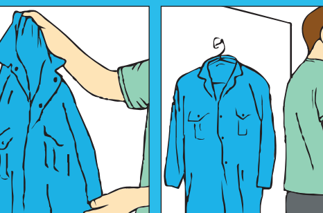
11. Handle dusty overalls with care